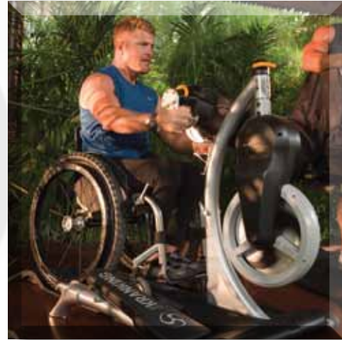
Figure 1. Average Exercise Intensity During the 30-Minute Krankcycle Workout

Whether or not it will ever approach the popularity and staying power that Spinning has enjoyed remains to be seen, but one thing is clear: Kranking is an effective workout and probably worth a second look. A